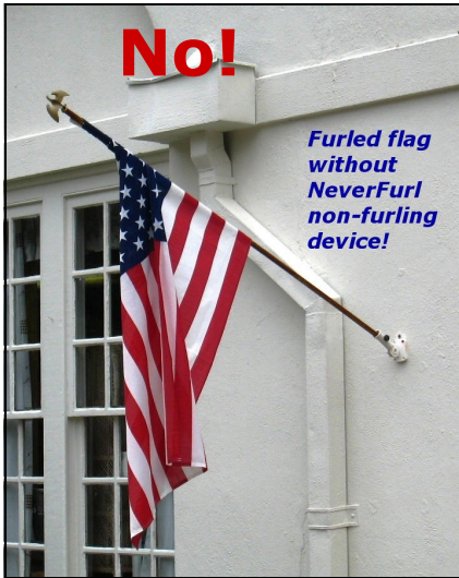
Furled flag without NeverFurl non-furling device!

Order yours now in time for flag season!